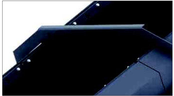
Anti Roll Flaps