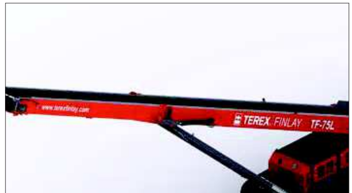
Full length Skirting